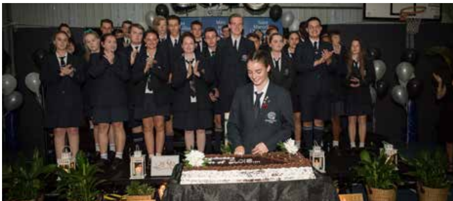
Mt Maria Year 12 Graduating Class of 2018

This experience of celebration and inclusion would not have been possible without the concerted effort of staff. The work our staff do in assisting our students to feel known and loved by God is paramount to our identity as Marists. So thank you to all the staff who have supported this mission and who, in a special way, have supported Marist Youth Ministry this year. You are appreciated!