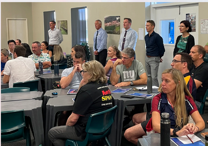
The College Leadership Team at St Augustine's College, Cairns, prays a blessing over the staff at the beginning of the new year as part of the spirituality formation program 'Created + Called: a revolution of love and tenderness'.

One Spirituality Day participant commented, "It was a reminder that all of us, including students and colleagues, are unique and loved at all times and that I have an important role in helping everyone at Chanel College to feel loved and valued to enable them to achieve their potential at all times".