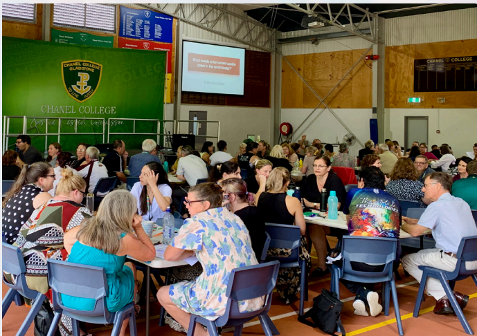
Staff at Chanel College Gladstone participating in the staff spirituality day program: 'Created + Called - a revolution of love and tenderness'.